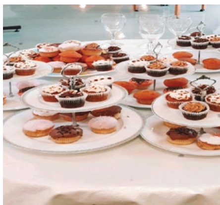
On of our Afternoon Tea parties